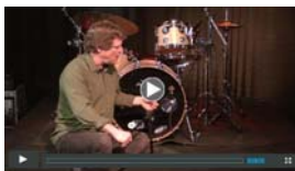
Micing your Drums with the Audix DP- QUAD