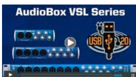
PreSonus AudioBox VSL Series Overview