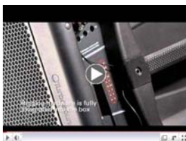
New Turbosound Flashline Slideshow